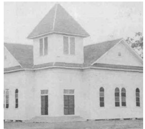
White frame structure 1915-1931