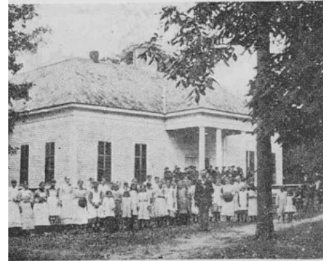
Alexander Institute 1873-1884