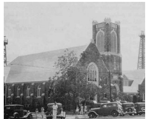
St. Luke's rock structure with early oil derricks in the background. Early 1930's.