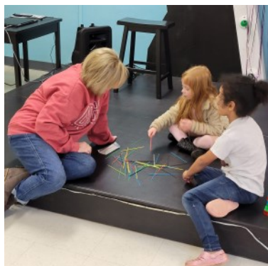
Learning and growing at Wednesday Night Bible Study.