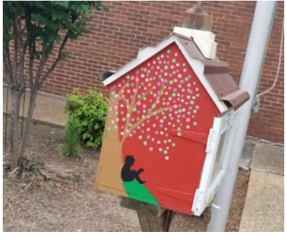
Shout out to Sally Holder for the beautiful artwork she added to our Little Free Library.