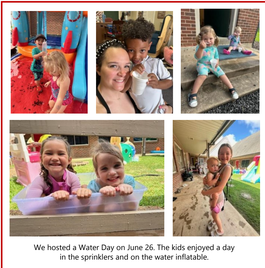
We hosted a Water Day on June 26. The kids enjoyed a day in the sprinklers and on the water inflatable.